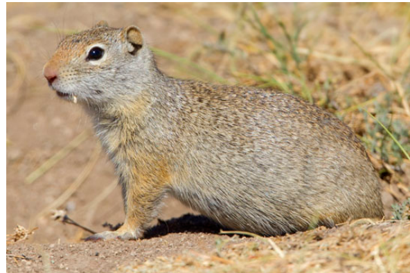
Figure 1. Richardson's ground squirrel

Further to this, the efficacy of some methods is dependent on the behaviour and feeding habits of the ground squirrels. Bait usage should be limited to early spring, before more desirable feed is available. Bait “shyness” can be avoided by “pre-baiting” gophers with untreated grain. Only apply treatment to areas where the presence of Richardson's ground squirrels has been confirmed.