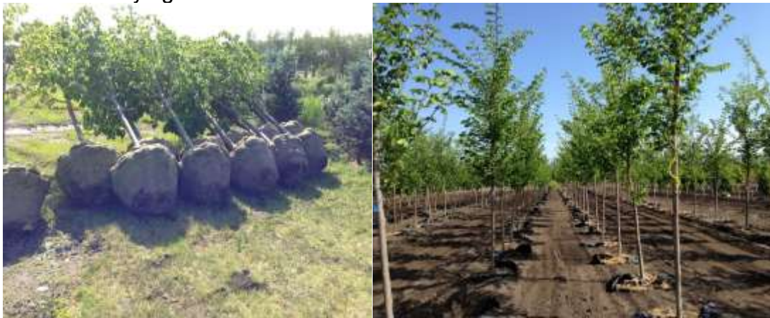
Picture 2. Burlap and Basket (B&B) tree requires additional equipment and care for transportation or planting.