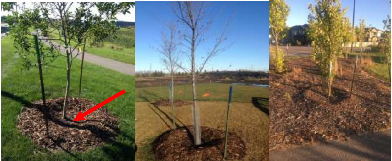
Picture 5. Create donut not volcano shape around trees with mulch. The arrow shows proper tree planting depth. Every tree has point where the trunk and roots join - it is called root collar. This root collar has to be visible after tree planting.